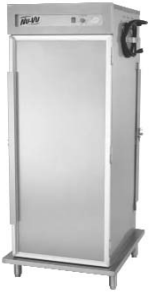
7500-H-UA13T (Shown with optional prison package)

The NU-VU® Top Mount Heated Cabinets are designed to hold food products in a lightly moisturized environment. A water pan is provided to permit natural evaporation, if desired. Convection heating system and side to side airflow ensures that the cabinet will hold proper temperatures prior to, and during, busy serving periods. The NU-VU® Heated Holding Cabinets are the premier choice for correctional facilities.